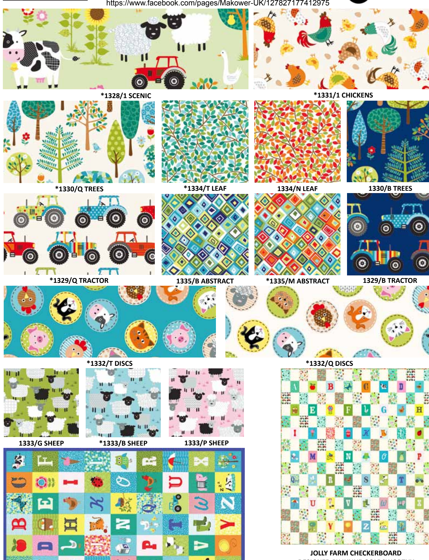
*1336/1 PANEL - each panel 60cms / 24" (10% of actual size) Fabrics shown are 50% of actual size unless otherwise stated